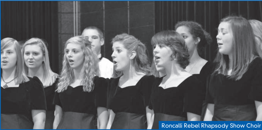
Roncalli Rebel Rhapsody Show Choir